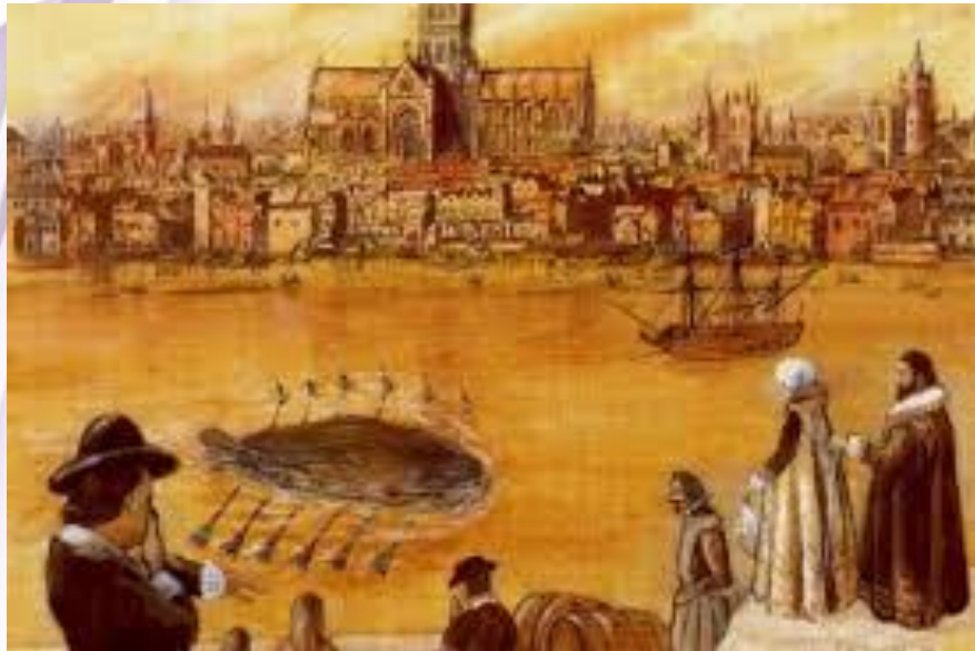
Cornelis Drebbel's submarine, 1620