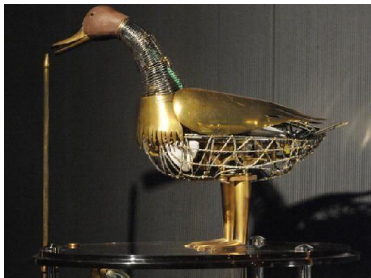
Vaucanson's Duck (1731)