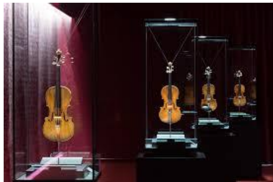
Cremona violin museum (c. 1720)