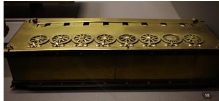
Blaise Pascal's mechanical calculator, 1642